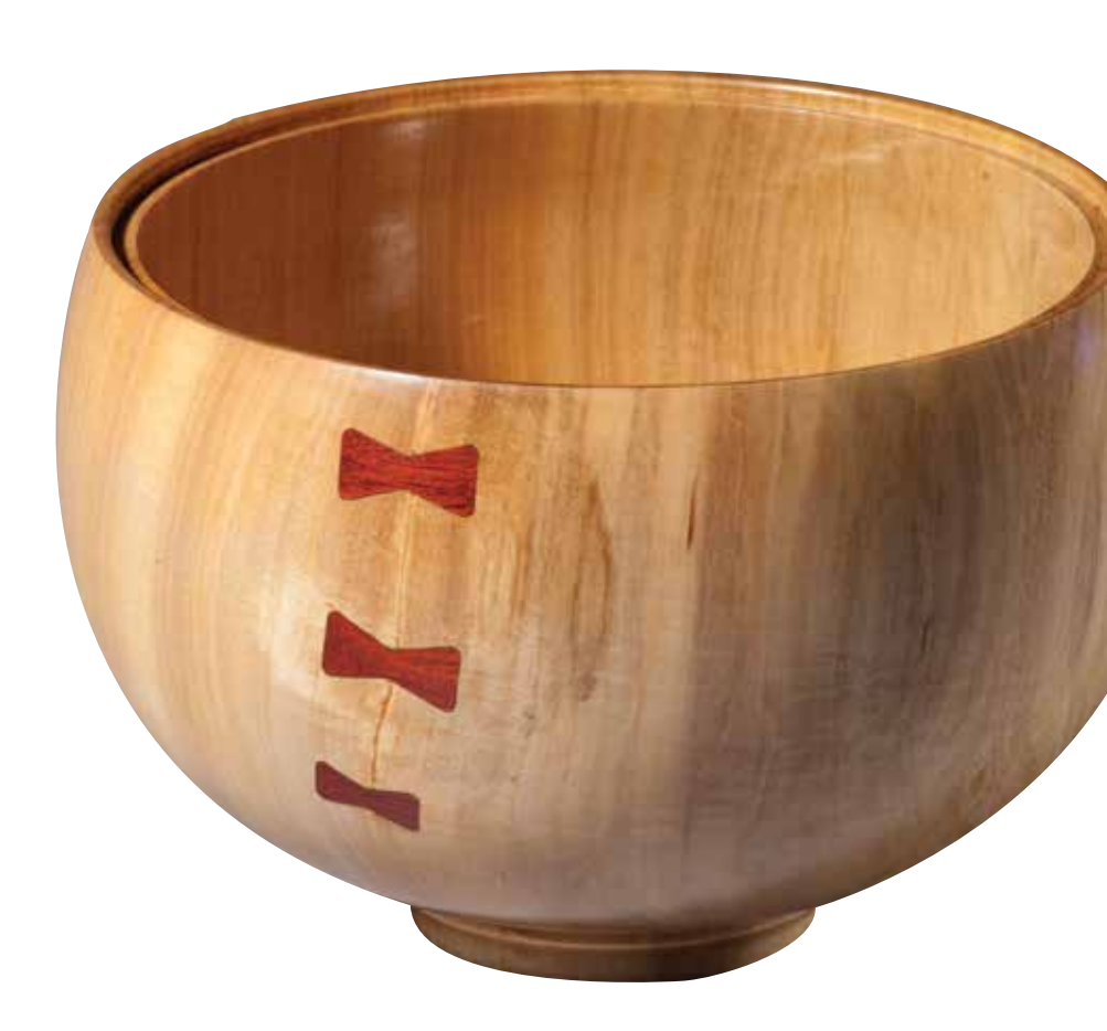
Dennis Belcher, Resurrection Series, 2010, Mineralized soft maple, padauk, 5" × 7" (13cm × 18cm)